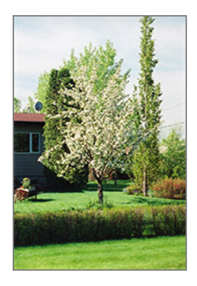
Parkland Apple in bloom

Serving City of Chestermere, the City of Calgary, City of Airdrie, Langdon, Rocky View County, Town of Strathmore, Wheatland County, and the surrounding area. We are located on the corner of Glenmore Trail S.E., 234011 Range Road 284 Rocky View County, Alberta, Canada