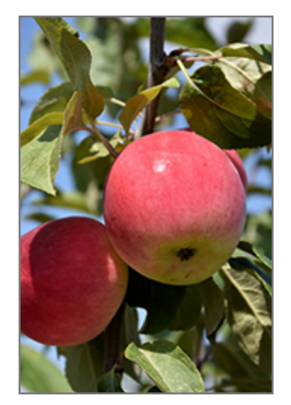
Parkland Apple fruit

Parkland Apple features showy clusters of lightly-scented white flowers with shell pink overtones along the branches in mid spring, which emerge from distinctive pink flower buds. It has forest green deciduous foliage. The pointy leaves turn yellow in fall. The fruits are showy chartreuse apples with a antique red blush, which are carried in abundance in late summer. The fruit can be messy if allowed to drop on the lawn or walkways, and may require occasional clean-up.