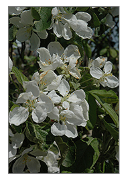
Parkland Apple flowers