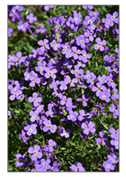
Little Treasure Deep Rose Wall Cress flowers