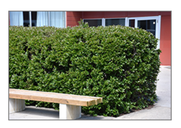
Hedge Cotoneaster