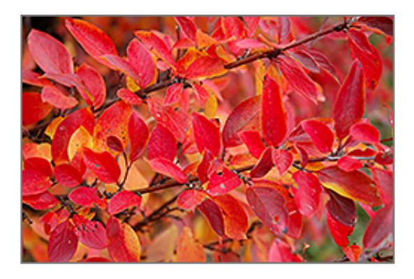
Hedge Cotoneaster in fall

Let us help you select the plant material for your upcoming projects. Call us today (403) 234-9190!