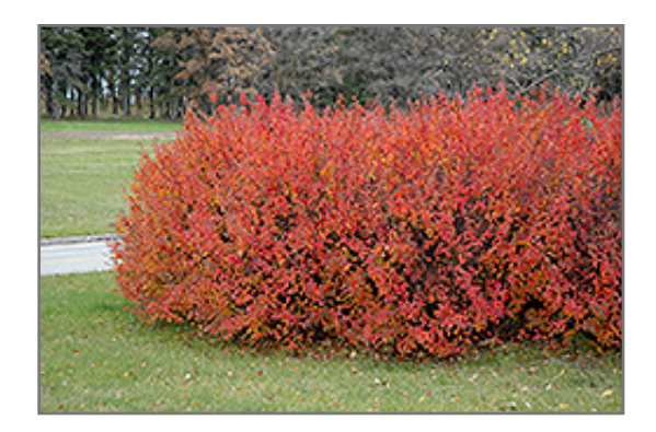
Hedge Cotoneaster in fall

This shrub does best in full sun to partial shade. It is very adaptable to both dry and moist locations, and should do just fine under average home landscape conditions. It is not particular as to soil type or pH, and is able to handle environmental salt. It is highly tolerant of urban pollution and will even thrive in inner city environments. This species is not originally from North America.