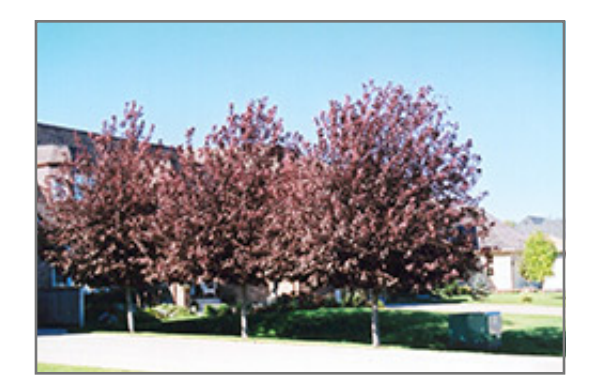
Schubert Chokecherry

Schubert Chokecherry is a deciduous tree with a more or less rounded form. Its average texture blends into the landscape, but can be balanced by one or two finer or coarser trees or shrubs for an effective composition.