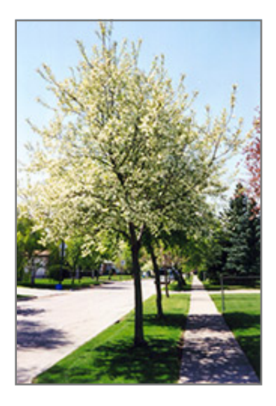
Schubert Chokecherry in bloom

Serving City of Chestermere, the City of Calgary, City of Airdrie, Langdon, Rocky View County, Town of Strathmore, Wheatland County, and the surrounding area. We are located on the corner of Glenmore Trail S.E., 234011 Range Road 284 Rocky View County, Alberta, Canada