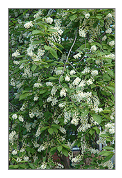
Schubert Chokecherry flowers

Schubert Chokecherry will grow to be about 25 feet tall at maturity, with a spread of 20 feet. It has a low canopy with a typical clearance of 4 feet from the ground, and is suitable for planting under power lines. It grows at a medium rate, and under ideal conditions can be expected to live for 40 years or more. This is a self-pollinating variety, so it doesn't require a second plant nearby to set fruit.