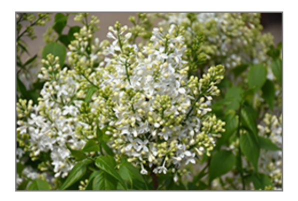
Mount Baker Lilac flowers