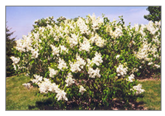
Mount Baker Lilac in bloom