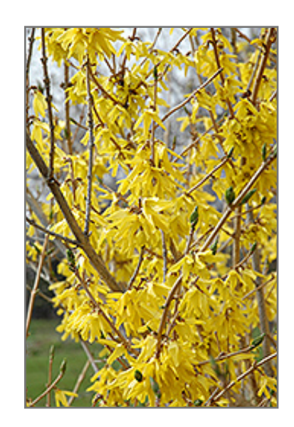
Northern Gold Forsythia flowers

Serving City of Chestermere, the City of Calgary, City of Airdrie, Langdon, Rocky View County, Town of Strathmore, Wheatland County, and the surrounding area. We are located on the corner of Glenmore Trail S.E., 234011 Range Road 284 Rocky View County, Alberta, Canada