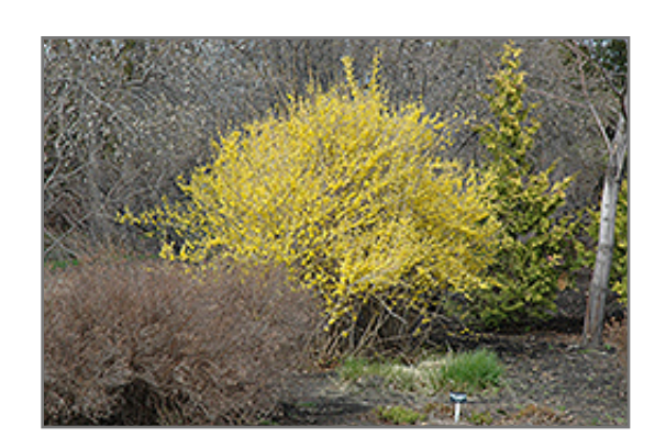
Northern Gold Forsythia in bloom

Northern Gold Forsythia is recommended for the following landscape applications;