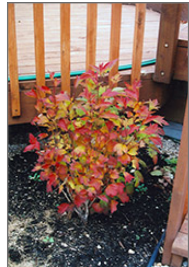
Compact Highbush Cranberry in fall

Serving City of Chestermere, the City of Calgary, City of Airdrie, Langdon, Rocky View County, Town of Strathmore, Wheatland County, and the surrounding area. We are located on the corner of Glenmore Trail S.E., 234011 Range Road 284 Rocky View County, Alberta, Canada