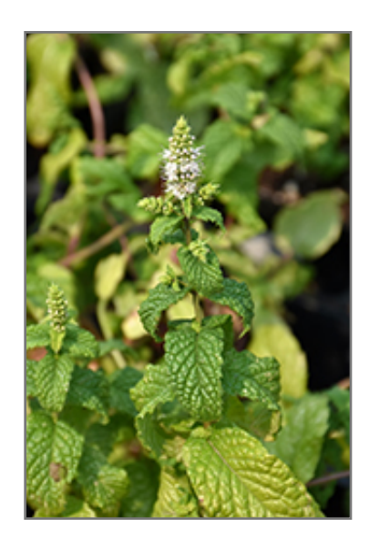
Mojito Mint foliage

Serving City of Chestermere, the City of Calgary, City of Airdrie, Langdon, Rocky View County, Town of Strathmore, Wheatland County, and the surrounding area. We are located on the corner of Glenmore Trail S.E., 234011 Range Road 284 Rocky View County, Alberta, Canada