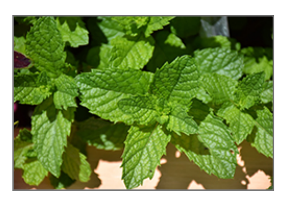
Mojito Mint foliage

Mojito Mint will grow to be about 30 inches tall at maturity, with a spread of 18 inches. Its foliage tends to remain dense right to the ground, not requiring facer plants in front. Although it's not a true annual, this fast-growing plant can be expected to behave as an annual in our climate if left outdoors over the winter, usually needing replacement the following year. As such, gardeners should take into consideration that it will perform differently than it would in its native habitat.