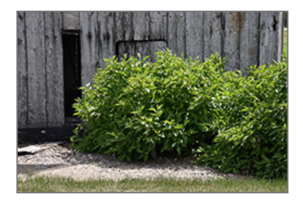
Little Rebel Dogwood