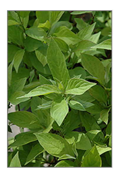
Little Rebel Dogwood foliage

Serving City of Chestermere, the City of Calgary, City of Airdrie, Langdon, Rocky View County, Town of Strathmore, Wheatland County, and the surrounding area. We are located on the corner of Glenmore Trail S.E., 234011 Range Road 284 Rocky View County, Alberta, Canada