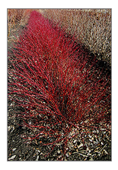
Little Rebel Dogwood in winter

This shrub does best in full sun to partial shade. It is an amazingly adaptable plant, tolerating both dry conditions and even some standing water. It is not particular as to soil type or pH. It is highly tolerant of urban pollution and will even thrive in inner city environments. This is a selected variety of a species not originally from North America.