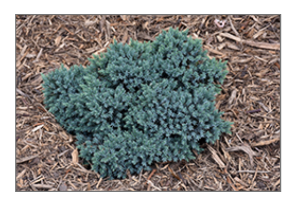
Blue Star Juniper

Serving City of Chestermere, the City of Calgary, City of Airdrie, Langdon, Rocky View County, Town of Strathmore, Wheatland County, and the surrounding area. We are located on the corner of Glenmore Trail S.E., 234011 Range Road 284 Rocky View County, Alberta, Canada