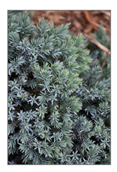
Blue Star Juniper foliage

Let us help you select the plant material for your upcoming projects. Call us today (403) 234-9190!