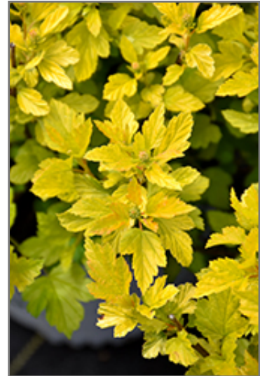
Tiny Wine Gold Ninebark foliage

Tiny Wine Gold Ninebark is recommended for the following landscape applications;