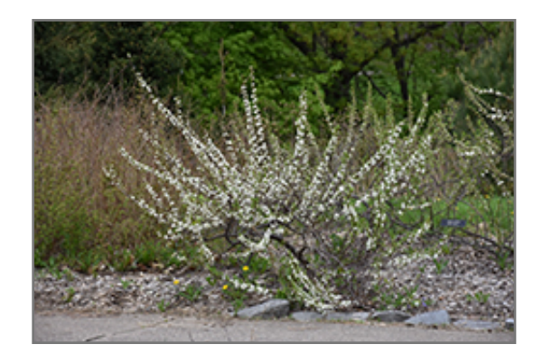
Sandcherry in bloom