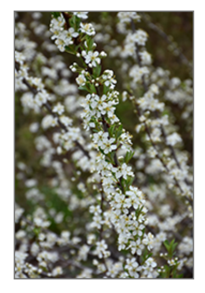
Sandcherry flowers

Let us help you select the plant material for your upcoming projects. Call us today (403) 234-9190!