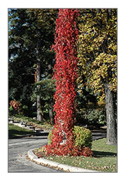
Virginia Creeper in fall

Let us help you select the plant material for your upcoming projects. Call us today (403) 234-9190!