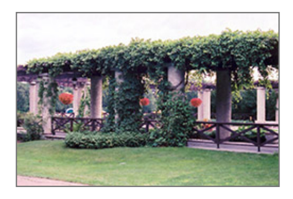
Virginia Creeper