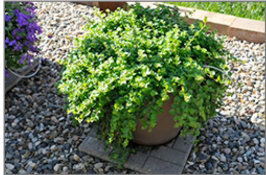
Indian Mint