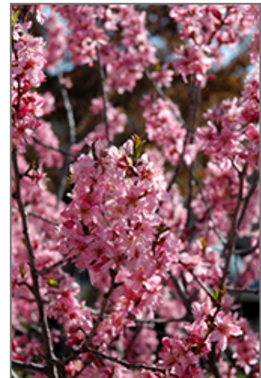
Muckle Plum (tree form) flowers

Serving City of Chestermere, the City of Calgary, City of Airdrie, Langdon, Rocky View County, Town of Strathmore, Wheatland County, and the surrounding area. We are located on the corner of Glenmore Trail S.E., 234011 Range Road 284 Rocky View County, Alberta, Canada