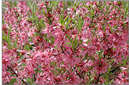
Russian Almond flowers