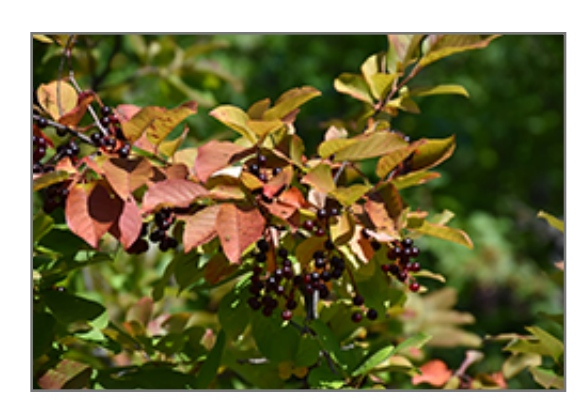
Chokecherry fruit