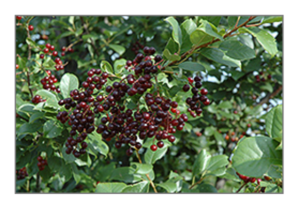
Chokecherry fruit

Serving City of Chestermere, the City of Calgary, City of Airdrie, Langdon, Rocky View County, Town of Strathmore, Wheatland County, and the surrounding area. We are located on the corner of Glenmore Trail S.E., 234011 Range Road 284 Rocky View County, Alberta, Canada