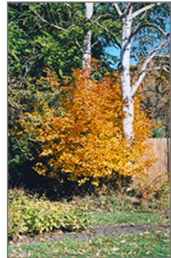
Native Saskatoon in fall

Serving City of Chestermere, the City of Calgary, City of Airdrie, Langdon, Rocky View County, Town of Strathmore, Wheatland County, and the surrounding area. We are located on the corner of Glenmore Trail S.E., 234011 Range Road 284 Rocky View County, Alberta, Canada