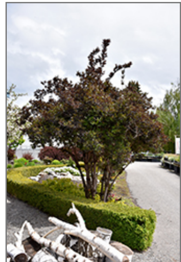
Black Beauty Elder

Serving City of Chestermere, the City of Calgary, City of Airdrie, Langdon, Rocky View County, Town of Strathmore, Wheatland County, and the surrounding area. We are located on the corner of Glenmore Trail S.E., 234011 Range Road 284 Rocky View County, Alberta, Canada