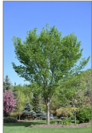
Brandon Elm