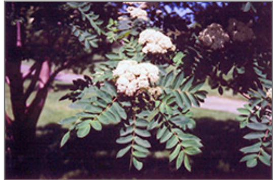
Showy Mountain Ash flowers

This tree should only be grown in full sunlight. It is very adaptable to both dry and moist locations, and should do just fine under average home landscape conditions. It is not particular as to soil type or pH. It is highly tolerant of urban pollution and will even thrive in inner city environments. This species is native to parts of North America.