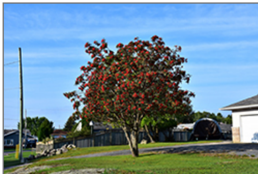
Showy Mountain Ash fruit