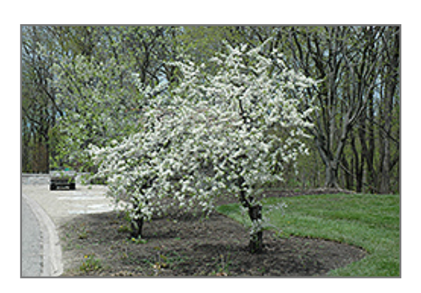
American Plum in bloom

Serving City of Chestermere, the City of Calgary, City of Airdrie, Langdon, Rocky View County, Town of Strathmore, Wheatland County, and the surrounding area. We are located on the corner of Glenmore Trail S.E., 234011 Range Road 284 Rocky View County, Alberta, Canada