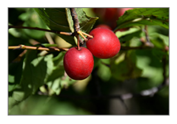
American Plum fruit

American Plum is clothed in stunning clusters of fragrant white flowers along the branches in early spring before the leaves. It has green deciduous foliage. The pointy leaves turn an outstanding yellow in the fall. The fruits are showy gold drupes with a ruby-red blush, which are displayed in mid summer. The fruit can be messy if allowed to drop on the lawn or walkways, and may require occasional clean-up. The smooth brown bark adds an interesting dimension to the landscape.