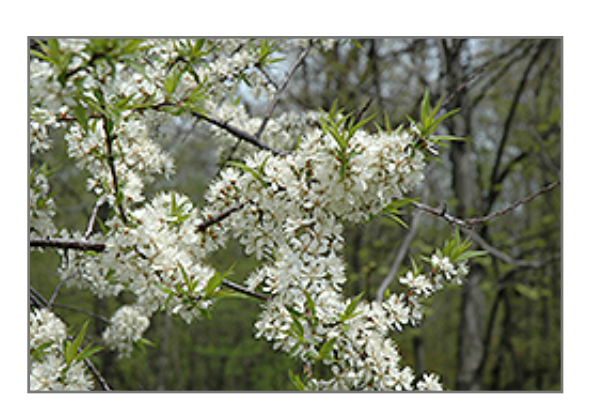
American Plum flowers