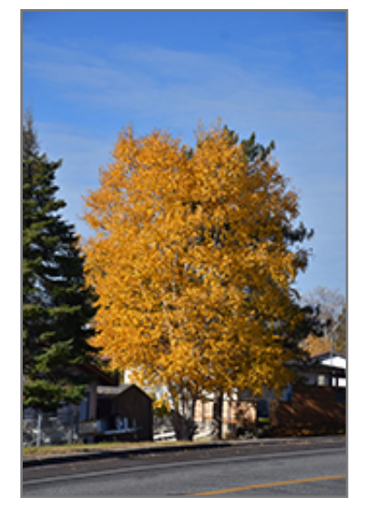
Clump Paper Birch in fall