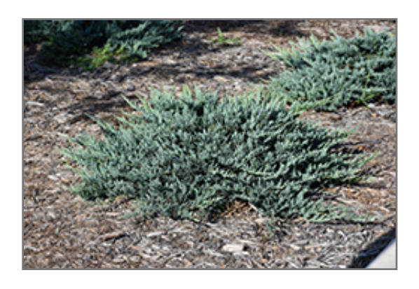
Blue Chip Juniper