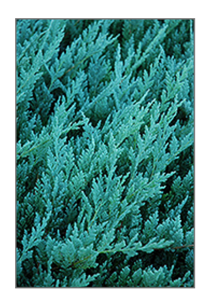
Blue Chip Juniper foliage