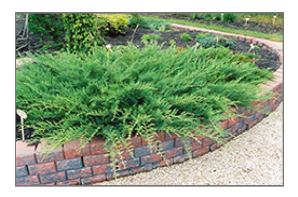
Blue Danube Juniper

Serving City of Chestermere, the City of Calgary, City of Airdrie, Langdon, Rocky View County, Town of Strathmore, Wheatland County, and the surrounding area. We are located on the corner of Glenmore Trail S.E., 234011 Range Road 284 Rocky View County, Alberta, Canada