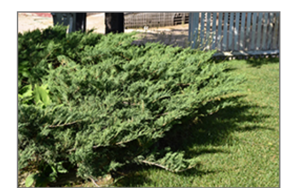
Blue Danube Juniper