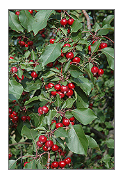
Selkirk Flowering Crab fruit

This tree should only be grown in full sunlight. It prefers to grow in average to moist conditions, and shouldn't be allowed to dry out. It is not particular as to soil type or pH. It is highly tolerant of urban pollution and will even thrive in inner city environments. This particular variety is an interspecific hybrid.