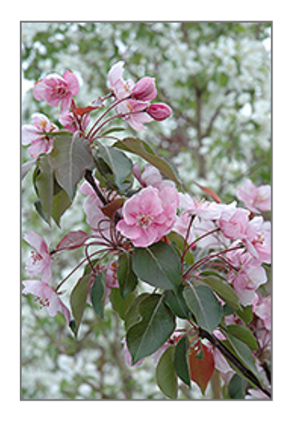
Selkirk Flowering Crab flowers

Serving City of Chestermere, the City of Calgary, City of Airdrie, Langdon, Rocky View County, Town of Strathmore, Wheatland County, and the surrounding area. We are located on the corner of Glenmore Trail S.E., 234011 Range Road 284 Rocky View County, Alberta, Canada