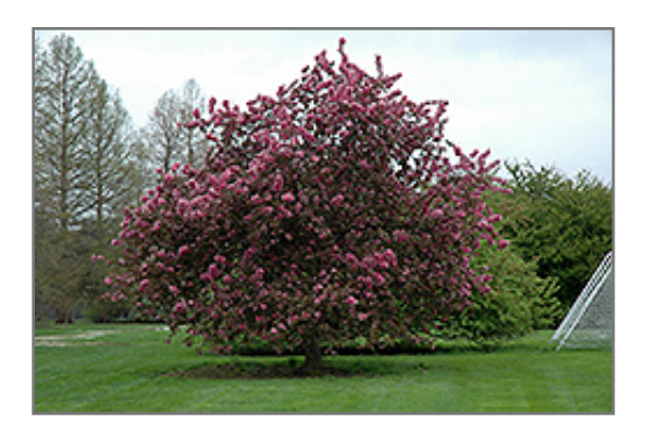
Selkirk Flowering Crab in bloom